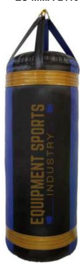
4FT Boxing MMA White/Gold Color Heavy Punching Bags -85LB 15" Diameter High-Grade Chrome D-Ring Hardware (Maximizes Life) Triple Stitched Straps and Seams High grade skins for Easy Cleaning and Durability Filled and ready for use Weatherproof